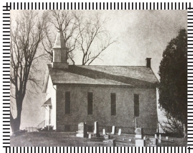
Here is a great picture of Welsh Church and cemetery in past times.