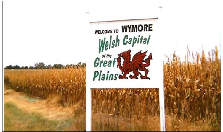
Above: Sign in front of the Welsh Heritage Centre. Upper right: Sign in field near Wymore. Right: Mural, Park, and Memorial Pavers Walk. Lower left is front of Centre which shows fence around the park. The lower left and right is taken in the auditorium and hallway.